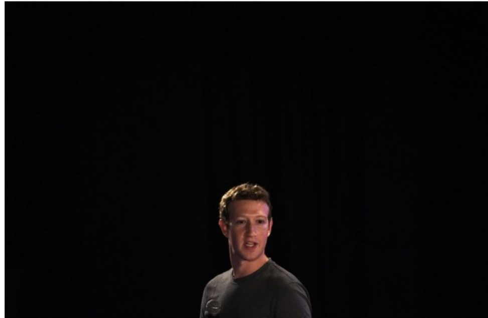
DARK HOURS. Zuckerberg will face US lawmakers on April 10 and 11, in what will be a turning point for the company and its future.

"It's clear now that we didn't do enough to prevent these tools from being used for harm as well. That goes for fake news, foreign interference in elections, and hate speech, as well as developers and data privacy."